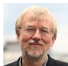
Jakob von Uexkull, Founder and Chair of the World Future Council

Envisioned by the World Future Councillors, the Global Policy Action Plan is the essential tool-kit for forward thinking policy-makers. It seeks to bridge the gap between research and implementation and achieve our sustainable development goals through clear vision. Based on shared values of 'future justice,' 'GPACT' recognises that policy solutions for transformational change already exist. This provides us with hope and inspiration to pass on a healthy planet and just societies to future generations.